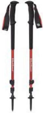
TREKKING POLES Rs. 250