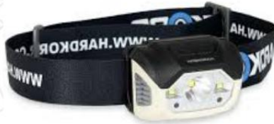
HEAD TORCH Rs. 250