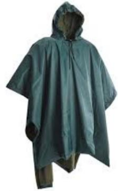
PONCHO Rs. 250