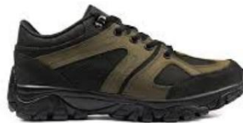
TREKKING SHOES Rs. 600

Note: Rest gears are available for purchase.