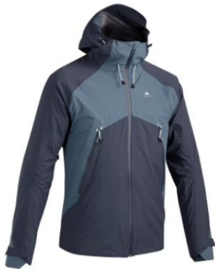
JACKET Rs. 600